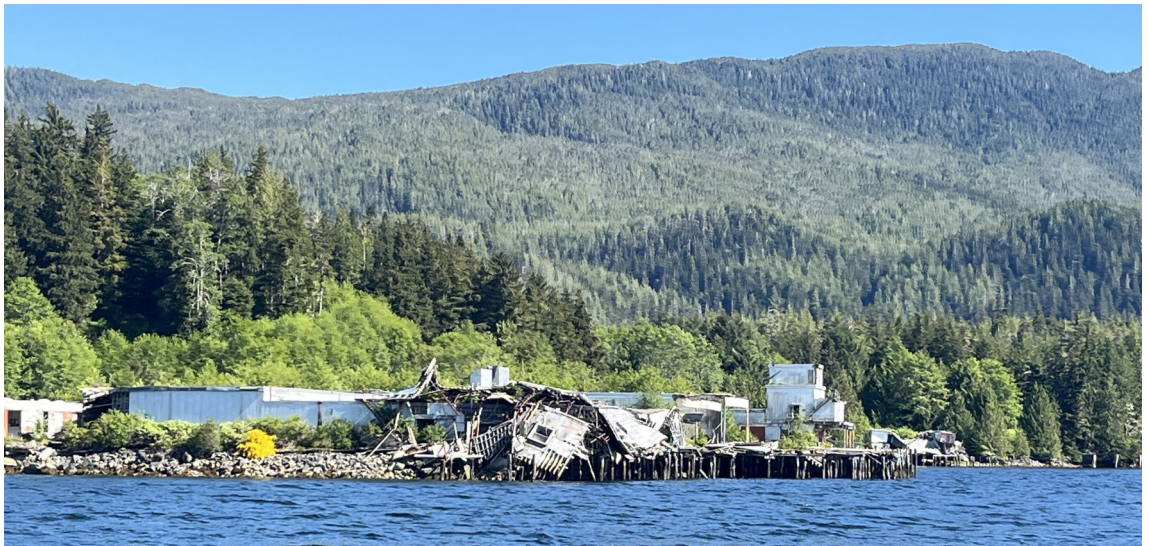
The scale of the Namu complex is really something but sounds like complicated ownership and the "pc" demands of the government environmentalists escalating the cost actually are preventing any clear up

was the second one. I had therefore been running on the wrong filter for several hundred hours completely oblivious to the fact that the engine might be running at a lower oil pressure than it desires