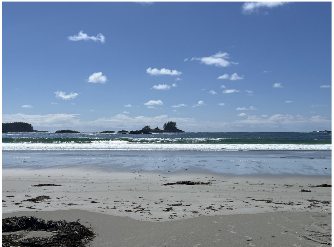
The wild west coast is just a short walk across the island

once but times changed and I guess that part of the market proved difficult to service. We met one of the founders of the institute and she explained that when they were looking for somewhere as a base it was a perfect solution. They had further improved it with a new dock, water system, large solar and battery installation etc etc. With experience of dealing with universities and research establishments they always seem to have funding problems and I asked her how they got on in that respect, Oh, we are self funded, I was told and that was that. Back at Lumina I got on to Google and found that the two founders sold their medical im-