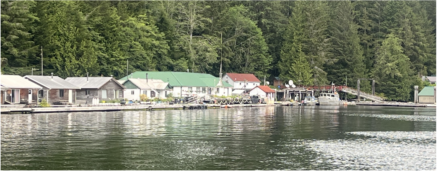
The rather depressed settlement of Dawsons Landing

and I hoped to get a new oil filter and secondly because I have a bit of Dawson in me and wanted a hat. Well that was a good enough reason for a slight detour into Rivers Inlet, one of the premier sport fishing areas in BC. It was a bit depressing, the only shop for maybe 50 miles run by an old couple who I am sure if it was viable would have passed it on to the next generation by now. On the wall in the shop is the stuffed