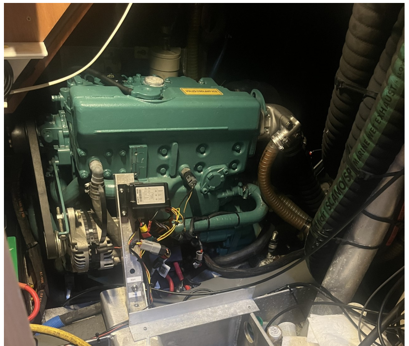
The trusty Volvo Penta with know doubt plenty of gremlins slumbering inside

remains of one the largest salmon ever caught at over 100lbs. It is an interesting settlement built entirely on log rafts made from enormous trees. I am not sure how old they would be but the size of the logs is certainly much larger than anything being cut today. It was however a rather sad site, we were the only customers, there didn't appear to be anyone staying in the cabins and no visiting boats tied up either. I had not realised that all was not so well with the sport fishing industry, there used to be many fishing lodges in Rivers Inlet but today there are just a handful and they would probably all be for sale if you came along with a cheque book. Young people apparently don't go fishing like they used to and places like this are always at a disadvantage to those closer to civilisation where logistics make it easier and cheaper to get the guests and supplies in and out. They might have the best fishing but if it costs you twice as much for your holiday then they lose out here.