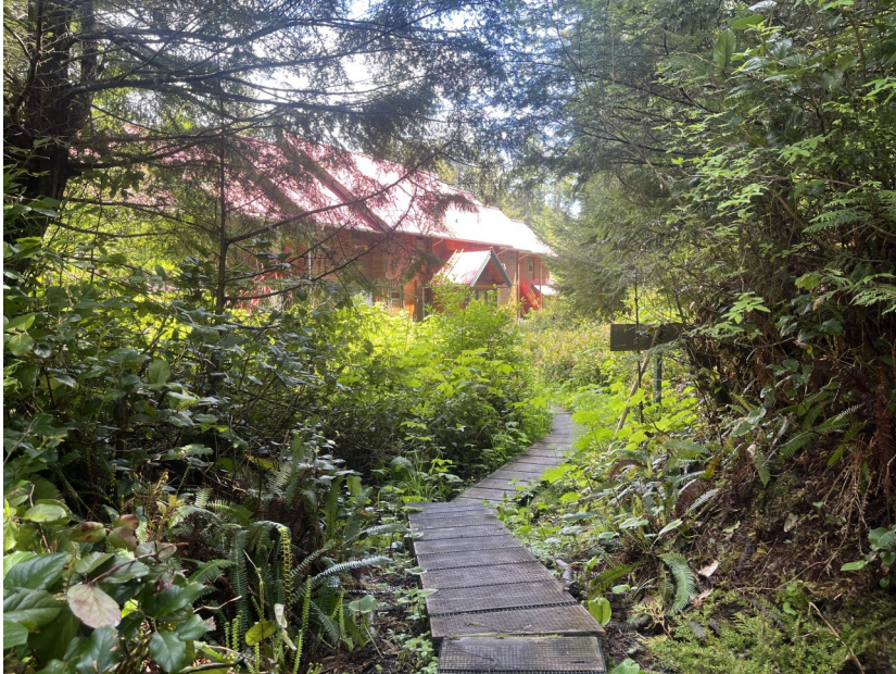
The Hakai Institute, with the local plants being favoured over the manicured lawns the fishing lodge once had

aging company for $300 million, set up the Tula foundation devoting the rest of their lives to the common good.