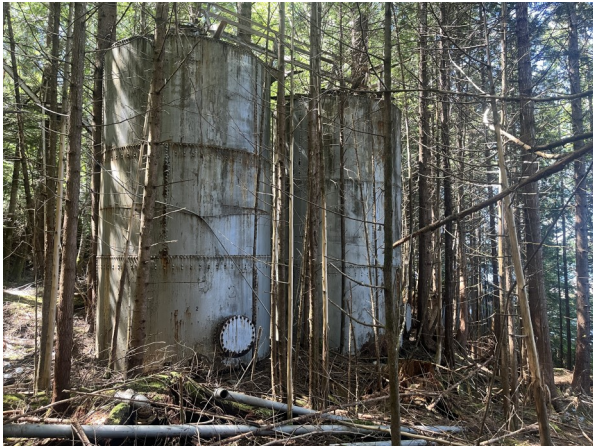
Esso once had a fuel dock at Namu, today the tanks rust in the forest that has grown up around them

year we called in at Namu, probably the best preserved and most extensive site. This only closed as a cannery in the 1980s but had a store and café running well into the 1990s. Like many it had suffered a major fire in 1962 so a lot of the buildings are relatively new (well younger than me—just). All the can-